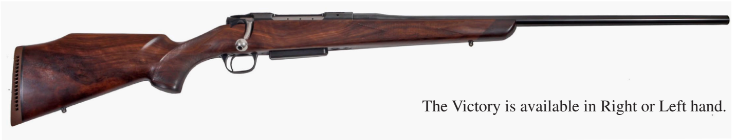
The Victory is available in Right or Left hand.

Timeless elegance is incorporated into every aspect of the Schultz & Larsen Victory. The one-piece bolt slides with a glass like smoothness in to the perfectly polished and blued action. Attention to detail abounds from the carefully sculpted curves of the action to the swept back bolt handle with the hollow cavity in the ball to reduce just a tiny bit more weight. Average weight of the Victory with the standard barrel is a trim 3.6 kg. Fluted barrels reduce this to between 3.4 kg and 3.5 kg. Magnum calibres come in at 3.7 kg.